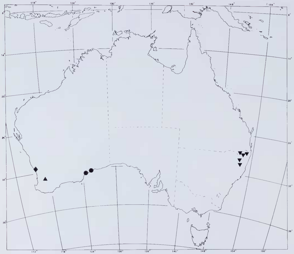
Map 1. Distribution of Banksia oligantha (▲), B. epica (●), B. leptophylla var. melletica (◆) and B. spinulosa var. neoanglica (▼).